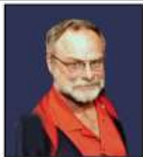
Gene Idol Taegeukdo 5th Degree North of Columbus REFeree - 2013 Taegeukdo 7th Eastern Division, GA